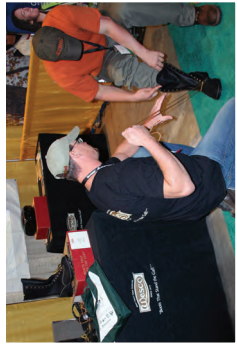
Official shoe of TCI EXPO! West Coast Shoe Company (Wesco®)